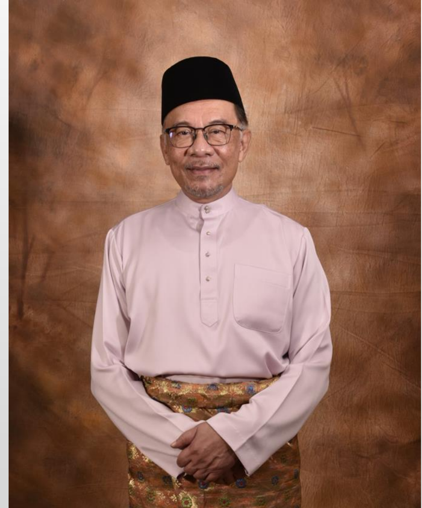
YAB Dato' Seri Anwar Bin Ibrahim The 10th Prime Minister of Malaysia