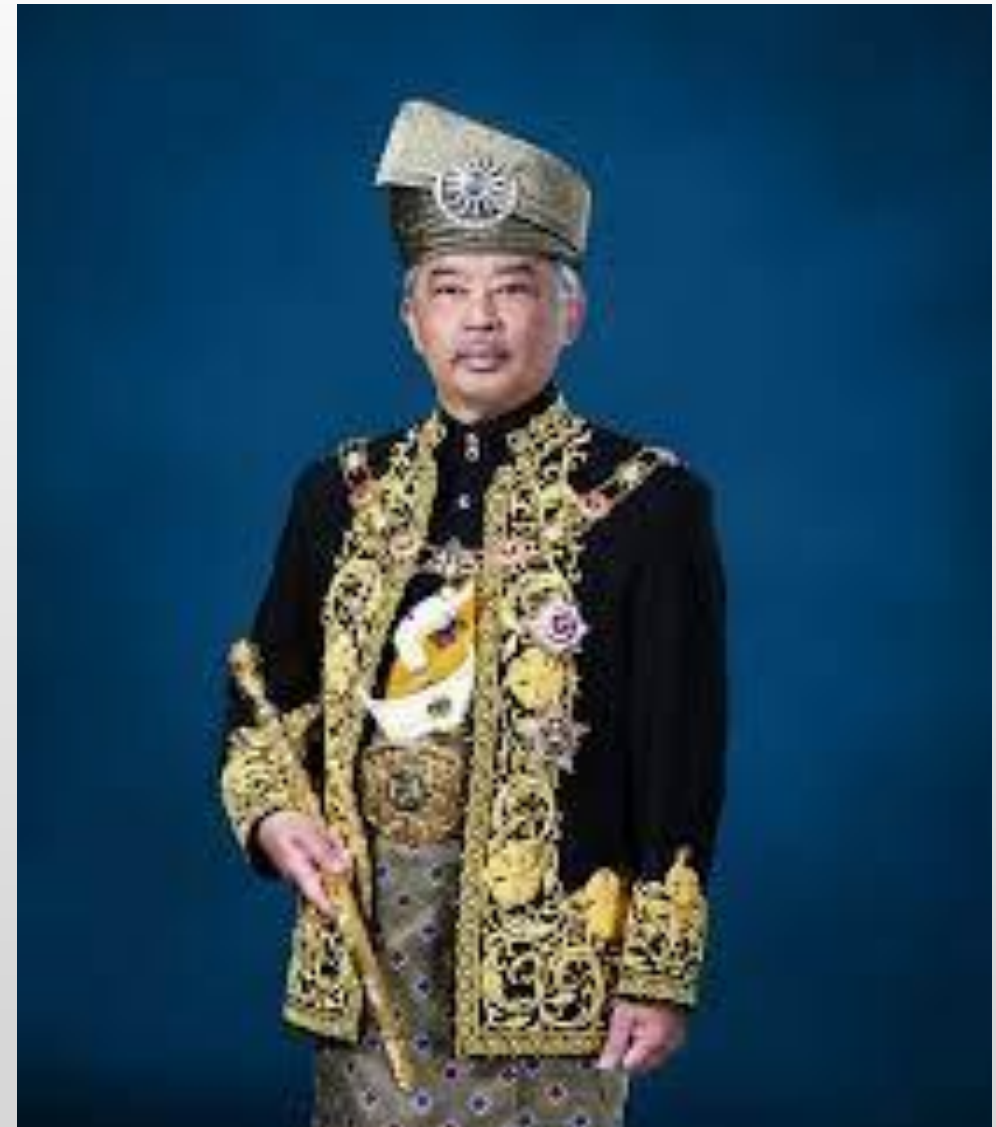
HIS MAJESTY SERI PADUKA BAGINDA THE YANG DI-PERTUAN AGONG AL-SULTAN ABDULLAH RI'AYATUDDIN AL-MUSTAFA BILLAH SHAH IBNI ALMARHUM SULTAN HAJI AHMAD SHAH AL-MUSTA'IN BILLAH

Nine of the states in Peninsular Malaysia are under the rule of Malay Kings (Sultans). The Government of the Constitutional Monarch is led by His Majesty the Yang di-Pertuan Agong, who is selected every five years from among the nine Malay Monarchs